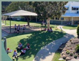
Year 5 taking the classroom outdoors